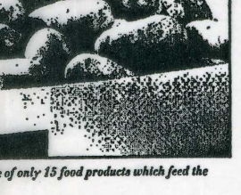
of only 15 food products which feed the

If you want to attend, and its highly recommended, contact the Grand Forks Convention and Visitors Bureau, 202 N. 3rd St, Suite 200, Grand Forks, ND 58203 or call: 800-866-4566.