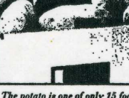
The potato is one of only 15 food products which feed the

WILLOW, AK— Competition for the largest potato sculpture has created a frenzy in this Alaskan town. Using whole potatoes, the sculptors ply their craft to see who will win top honors.