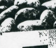
The potato is one of only 15 food products which feed the entire world.

WILLOW, AK— Competition for the largest potato sculpture has created a frenzy in this Alaskan town. Using whole potatoes, the sculptors ply their craft to see who will win top honors.